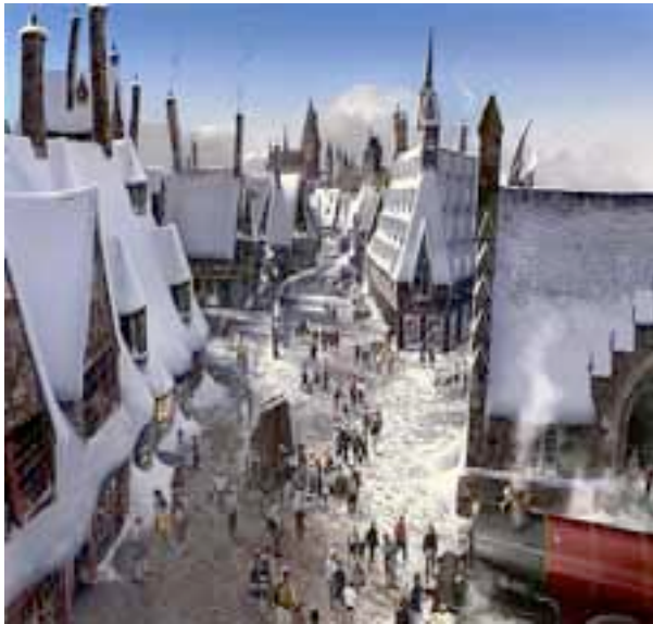
Universal Orlando Resort