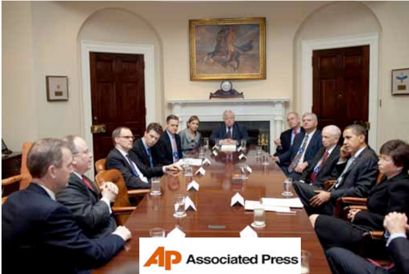
White House Says It Encourages Business Travel