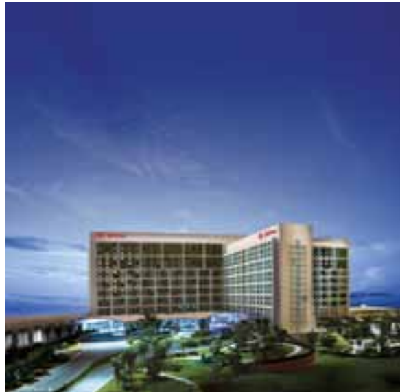
The Hilton Orlando