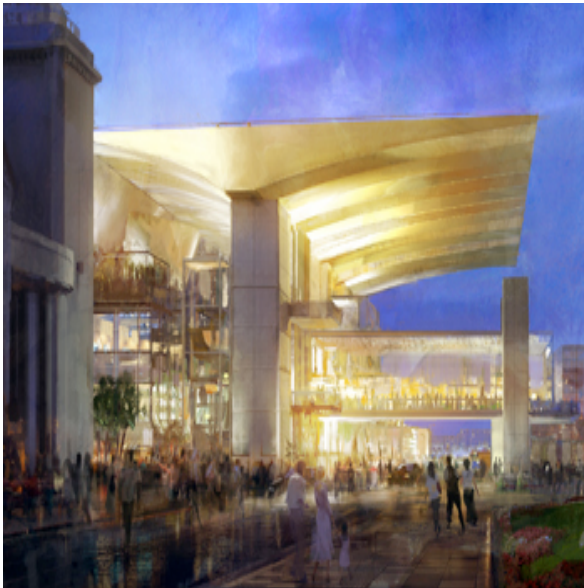
Performing Arts Center